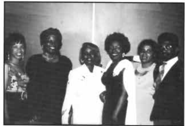
NEW JERSEY UNITING TALENTED YOUTH IN NEW JERSEY