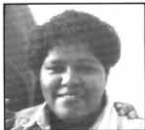
ARIZONA, COLORADO, IDAHO, IOWA, KANSAS, MONTANA NEBRASKA, NEW MEXICO, NORTH DAKOTA, SOUTH DAKOTA, UTAH & WYOMING