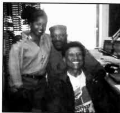
Isaac Hayes visited WBLS