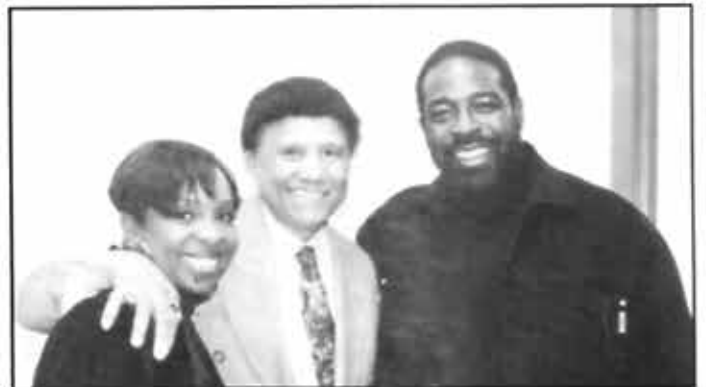
Gladys Knight and Les Brown visit Hal at WBLS